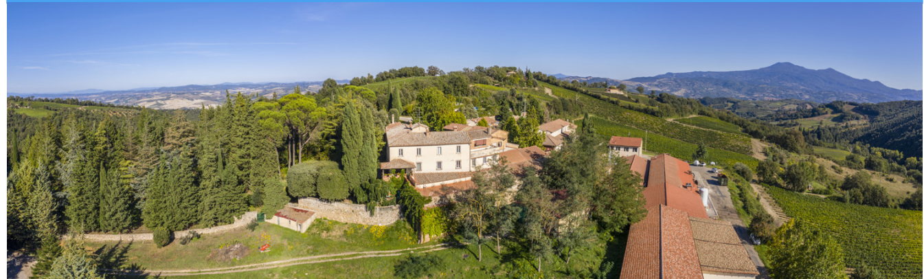
VILLA PODERNUOVI AND CELLARS, MONTALCINO