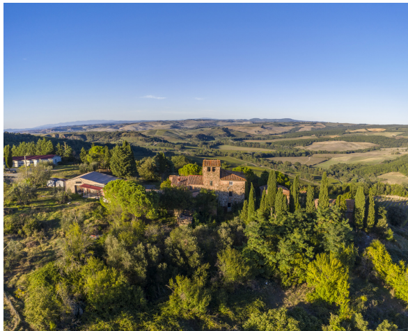
FATTORIA DEI BARBI, MONTALCINO