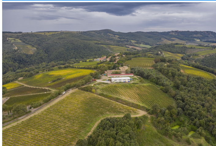
PODERNOVACCIO AND POGGIO, MONTALCINO