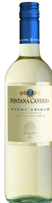
PINOT GRIGIO DOC